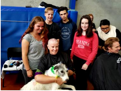
The VCAL group