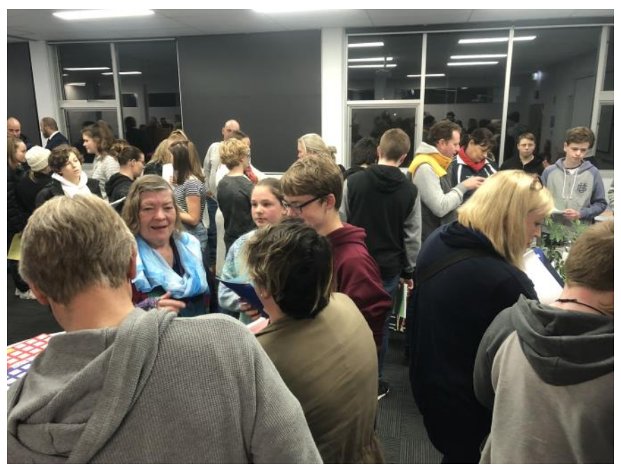
Any students who missed out on the information distributed at EXPO can collect from front office. Initial subject selection forms should now all be returned.